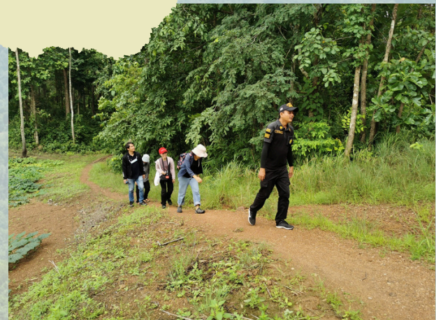
The village headman of Ban Tung Pham took us to see the community forest and explained about its management.