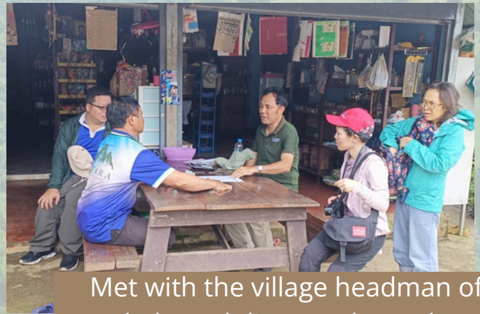
Met with the village headman of Lekoh and discussed together.