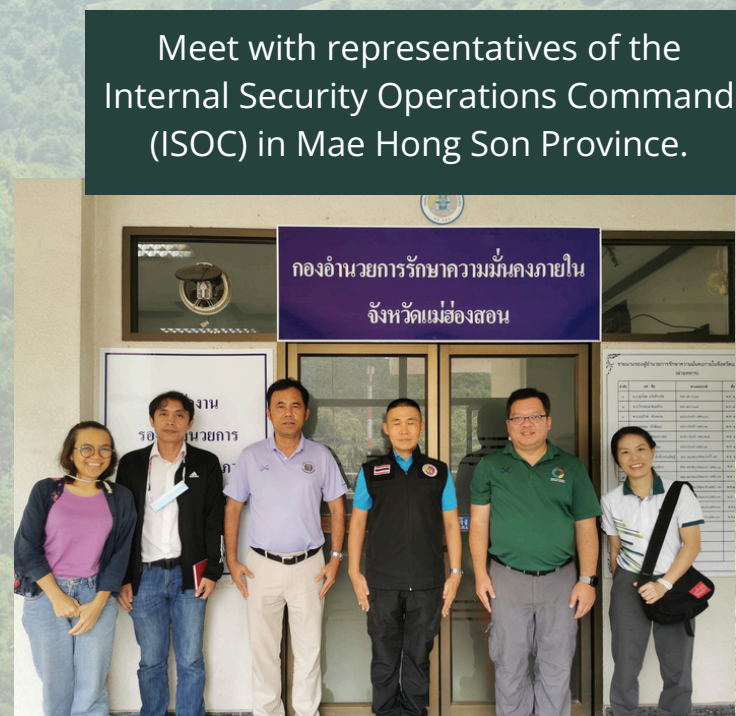
Meet with representatives of the Internal Security Operations Command (ISOC) in Mae Hong Son Province.