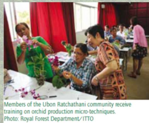
Members of the Ubon Ratchathani community receive training on orchid production micro-techniques.