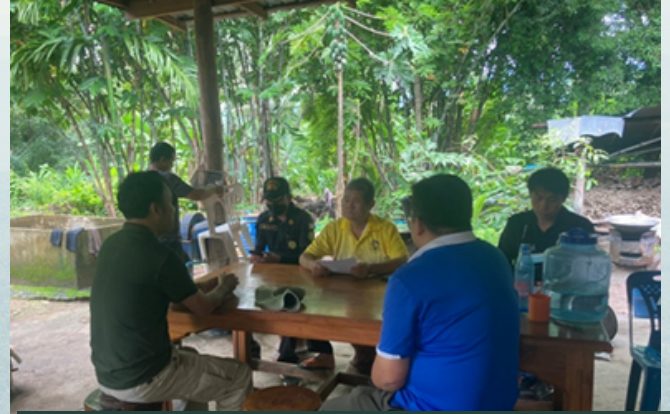
Met with the village headman of Mae Thalu and discussed together.