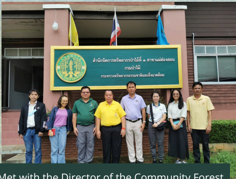
Met with the Director of the Community Forest Management Division at the Forest Resource Management Office 1 in Mae Hong Son.

Later that morning, the team met with the Internal Security Operations Command (ISOC) in Mae Hong Son Province. During this meeting, the team discussed and clarified project details with ISOC and talked about the situation along the Thai-Myanmar border. The team also discussed the use of drones in the area, and initially, the ISOC approved the drone operations to take place between November and December 2024.