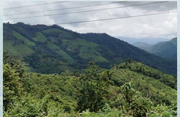
Meet the leaders of the Ban To Pae community forest.