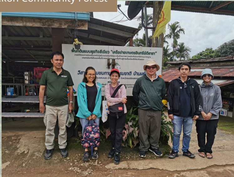
Lekoh Community Forest